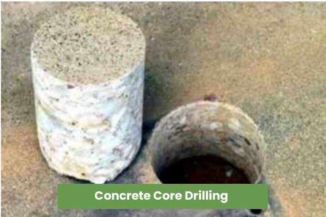
Concrete Core Drilling