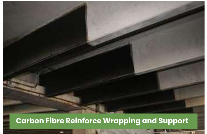
Carbon Fibre Reinforce Wrapping and Support