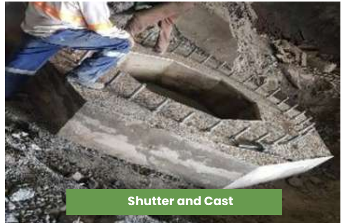
Shutter and Cast