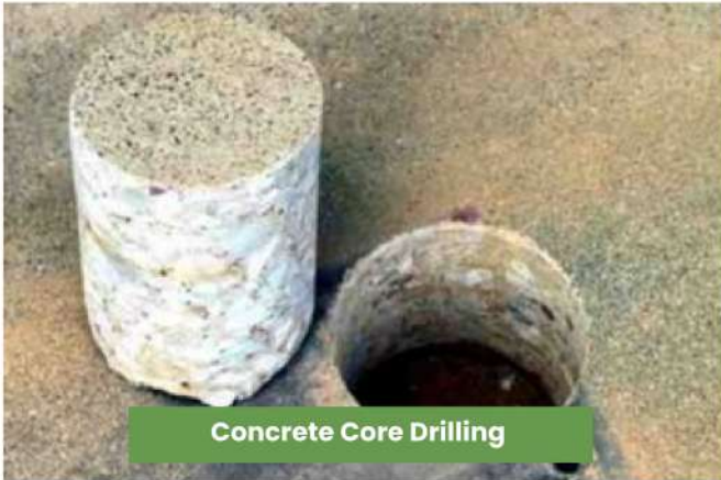
Concrete Core Drilling