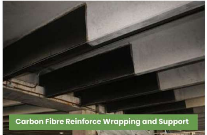
Carbon Fibre Reinforce Wrapping and Support