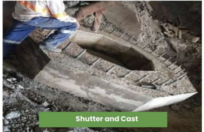
Shutter and Cast