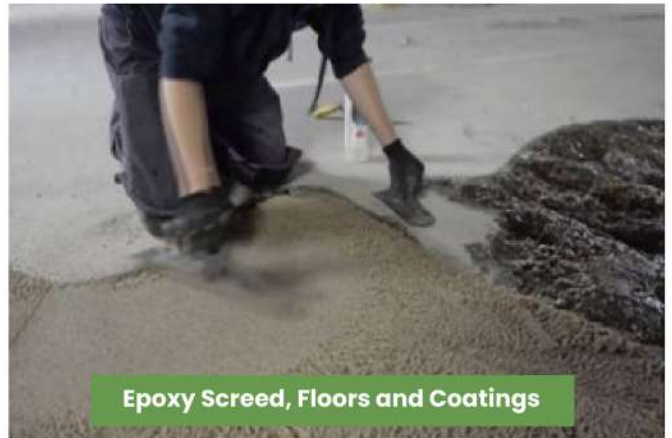
Epoxy Screed, Floors and Coatings